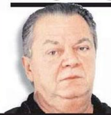
Ex-Bonanno boss "Big Joey" Massino (left), a.k.a. "The Last Don," is now the first don ever to turn rat. He took the stand in Brooklyn yesterday to help the feds nail his successor, "Vinnie Gorgeous" Basciano (right), for murder.